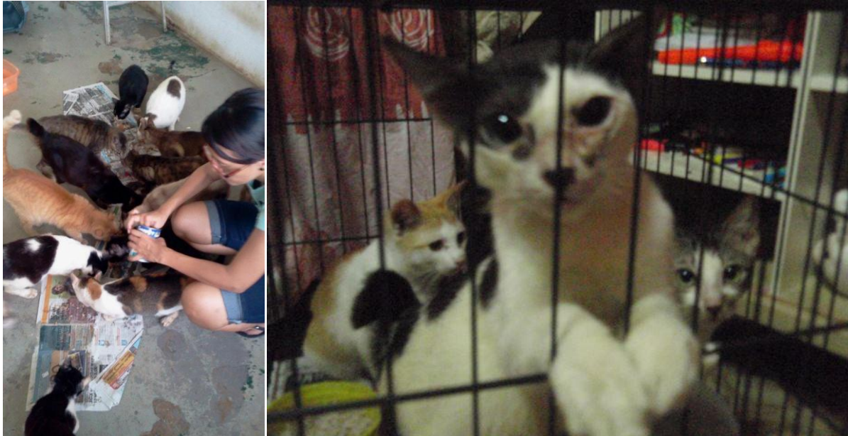
Cats in hoarder homes

sterilise the cats and rehome them where possible. Their efforts are often paid off when family members and cats are provided with relief from a spiraling situation. However, there is still difficulty in finding a long-term solution without support from HDB and other agencies and organisations, especially when there are other social issues involved, e.g. poverty and mental health issues. The Society continues in its efforts to establish meaningful collaborations with other organisations to handle these cases.