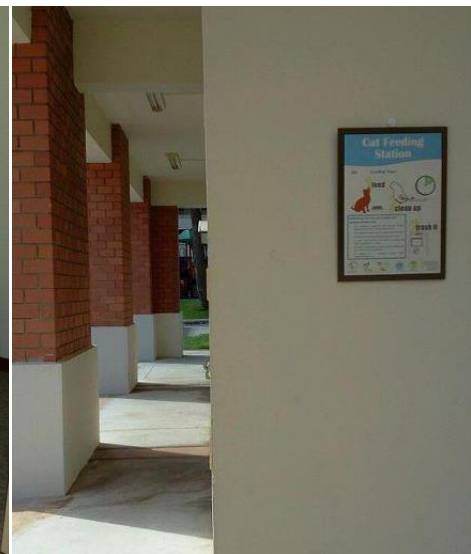
A feeding station at Chong Pang

The pilot was accompanied by a four-month review by a joint-agency task force led by the Ministry of National Development (MND) on pet ownership and stray management policies. A cat ownership pilot was mooted for launch in 2012.