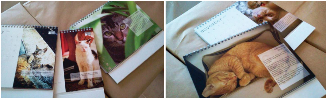
Our first calendar, featuring Duke Orange!

In 2011, we launched the first ever CWS Calendar. Designed by the Brew Creative team, the calendar featured community cats in their natural environment in the concrete jungle that is Singapore. 1700 copies of the calendar were sold out in 2 months.