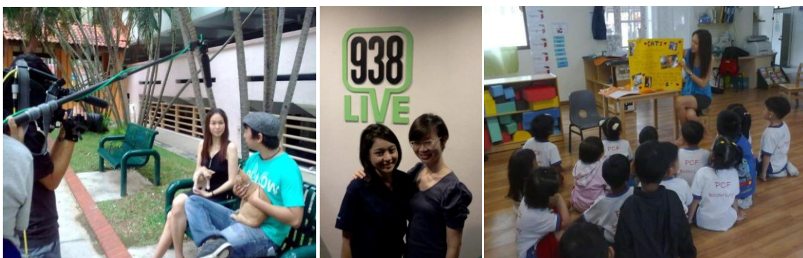
From kids television shows, radio interviews to a captive audience of children

CWS has been featured heavily in the media in 2011 and we have been invited to participate in several national-media programmes. From interviews on radio to filming for a children's programme, each platform serves as an opportunity to reach a wider audience and get them interested in cat welfare.