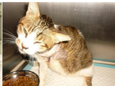
Cat with neurological damage