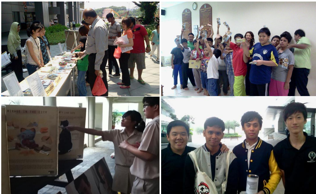
Outreach at offices, childrens' homes and in schools

Students were also encouraged to join our outreach efforts through Flag Day, running awareness booths in their school to educate their peers or join us in community engagement activities such as the Chong Pang door-to-door survey.