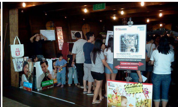
Large crowds gathered at the drives