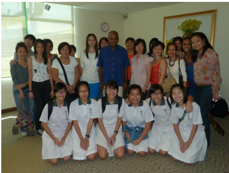
Thank you session hosted by Minister K. Shanmugam

One of the issues faced in the pilot programme was the increased abandonment in Chong Pang in particular. This continued to put a burden on caregivers unless more can be done to promote responsible cat ownership at a national level.