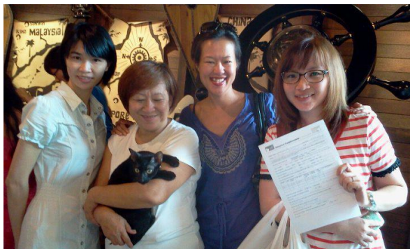
One of the adopted cats with foster and adopter

Other noteworthy cats include a three-legged cat which had been abandoned by her irresponsible owner after she fell out of the window. A caregiver took her in, rehabilitated her and she was adopted at the very first drive.