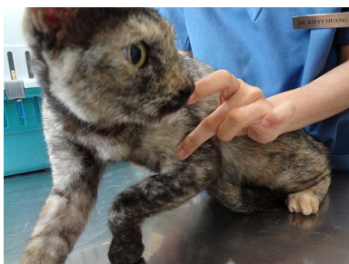
Cat with fractured leg

In understanding of this, the Special Appeals section of CWS was launched in 2010 and continues to be run. Through the generosity of the public who follow the appeals on our Facebook page or website, we have closed 87 appeals in 2011. This is a 320% increase in closed appeals.