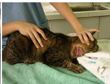
Cat with gaping neck wound