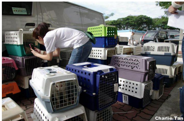
On the way to the vet!

Against this backdrop of heightened awareness, the sterilisation slots were filled up rapidly once registration was opened. In the days before Spay Day, teams of caregivers and mediators hit their neighbourhoods trapping extensively in time for the cats to be fasted and dropped off at Ang Mo Kio and Bedok collection points ready for surgery.